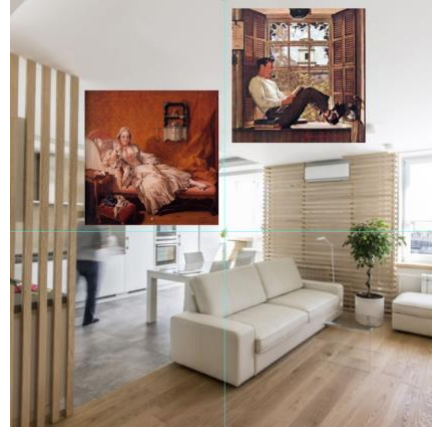
Francois Boucher, Madame Boucher (1734) detail Norman Rockwell, untitled (1946) detail Loft detail:

Studio: Cowgill Hall 3rd Floor MWF 1:30 – 5:15pm Seminars: TBD Office hours: MWF 11:00 – 12:00 or by appointment Contact: Office: 540-231-2680 Email: hdehahn@vt.edu