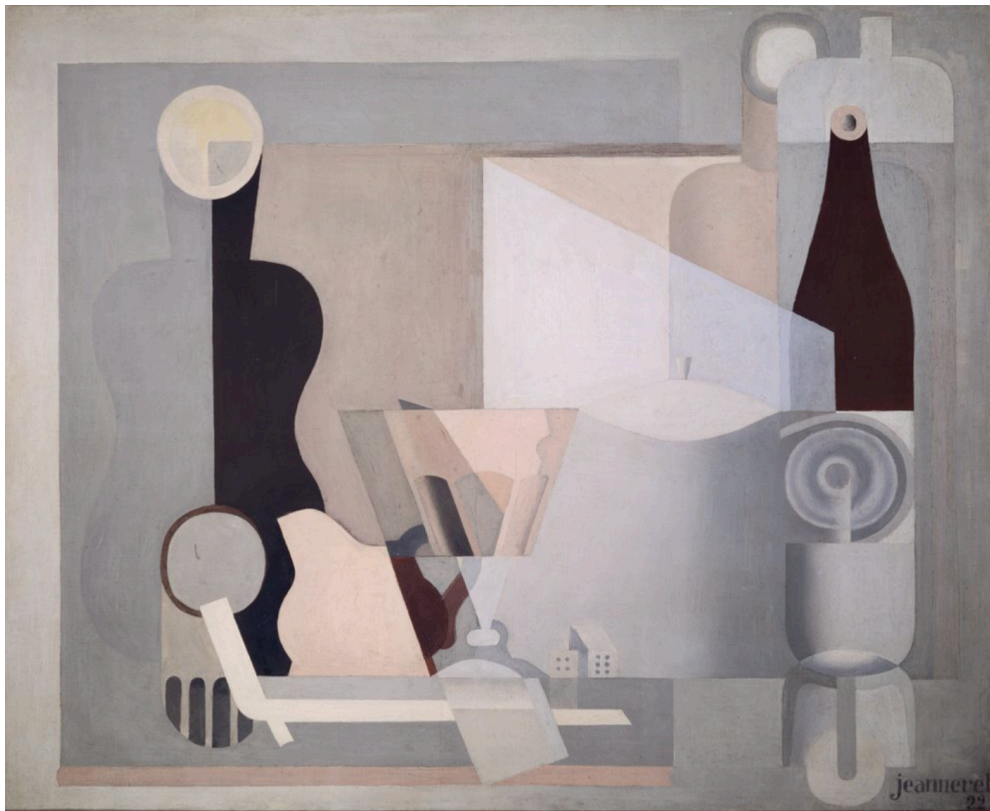
Le Corbusier, Pale Still life with lantern (1922)