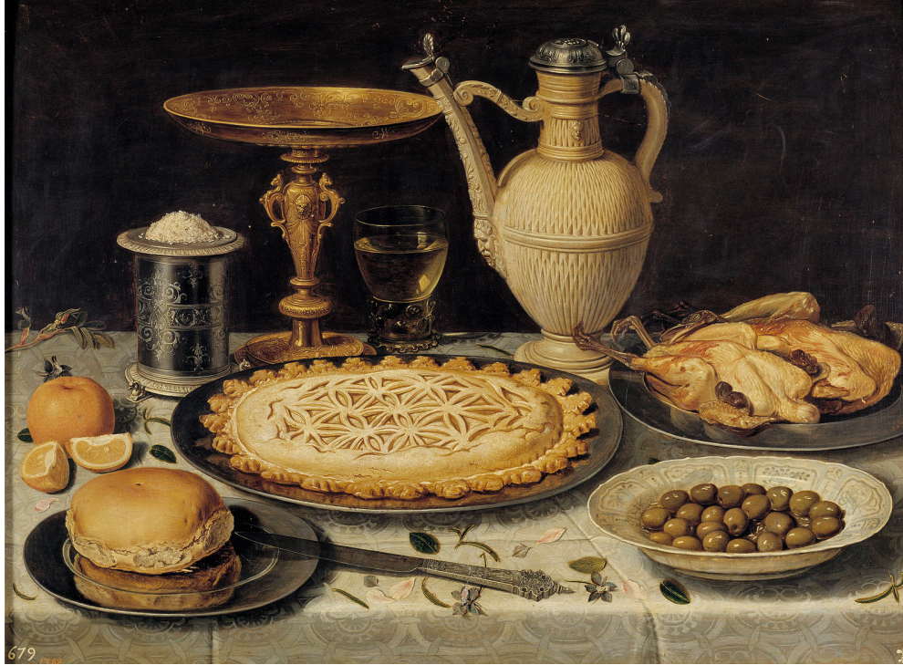
Clara Peeters, Still life with tazza, stoneware jug, saltcellar and dainties (circa 1611)