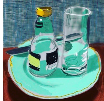
Still life by David Hockney Unknown date

Studio: Cowgill Hall 4th Floor MWF 1:10 – 5:00pm Seminars: TBD Office hours: MWF 11:00 – 12:00 or by appointment Contact: Office: 540-231-2680 Email: hdehahn@vt.edu