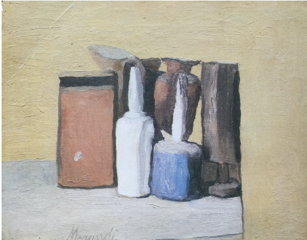
Giorgio Morandi, Still-life (1949)